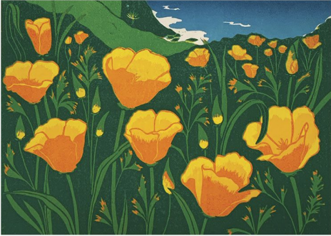
detail: Aching in My Heart , 2021 oil ink on japanese fiber