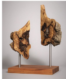
Parted 1 , 2021 pecan, mahogany, steel

Cowan Blakely Building Atrium (Fishbowl)