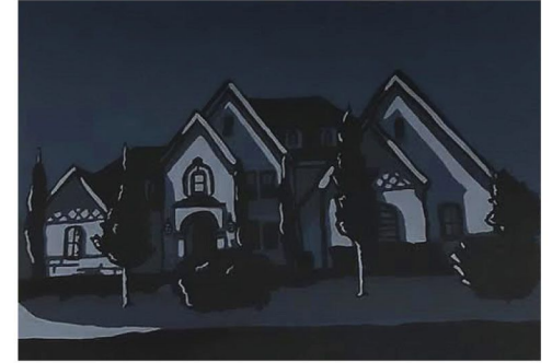
7104 , 2021 acrylic on cotton fiber