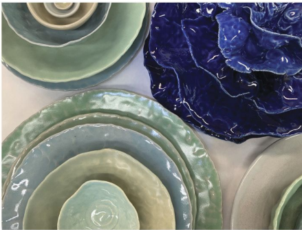
detail: Unfamiliar Blooms , 2021 porcelaneous stoneware, glaze

Painting/Printmaking Building, Upper Gallery